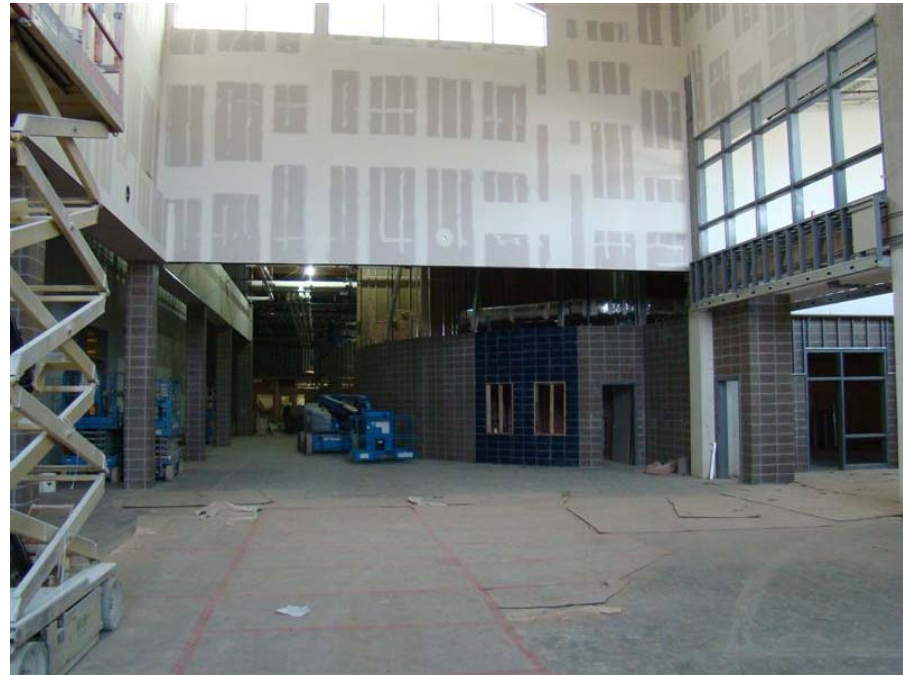
Curved Masonry Wall Toward Cafeteria