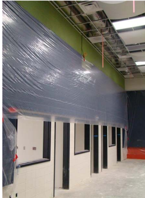
Band Hall/ Offices