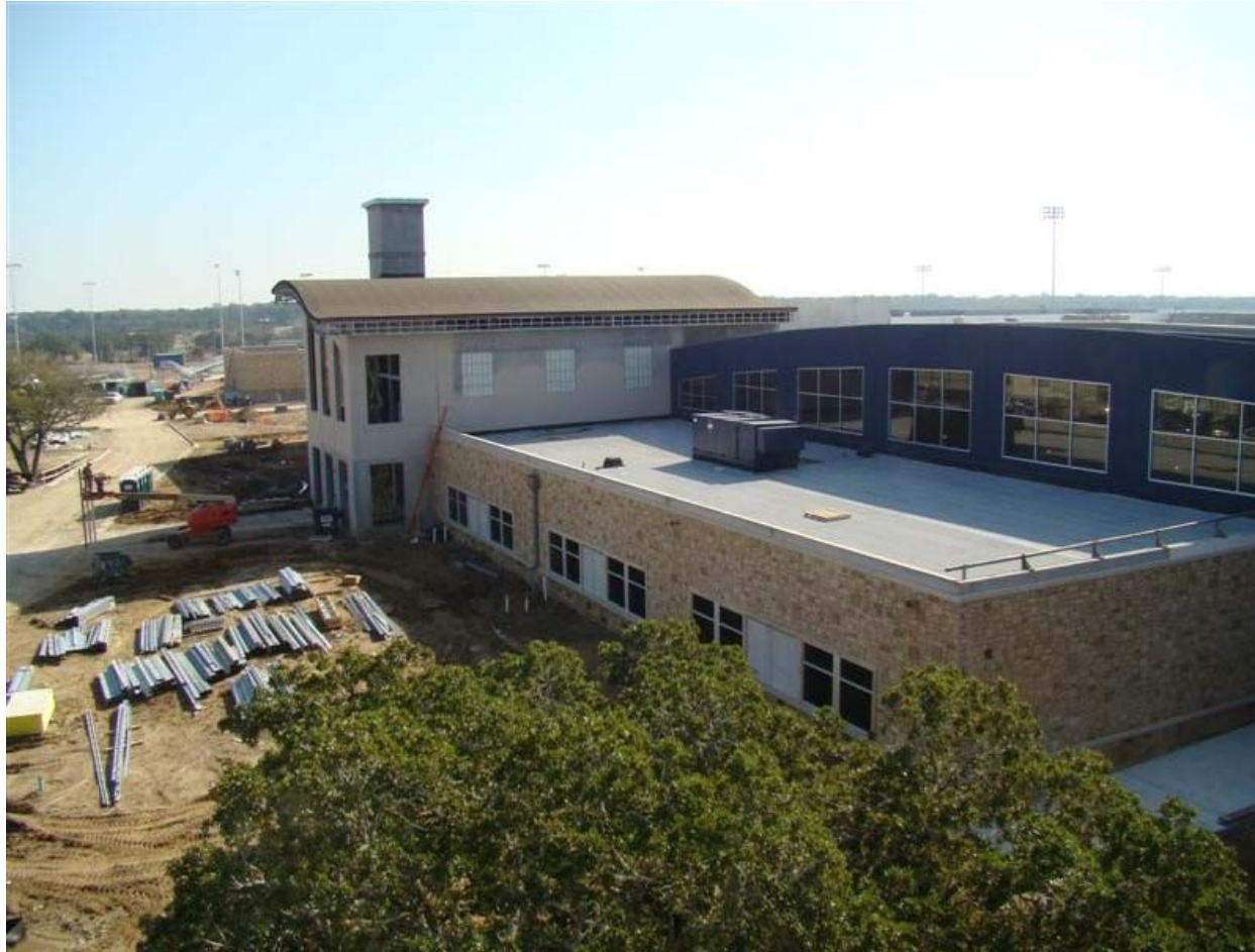
Exterior View of Admin Area/ Main Entry/ "Main Street"