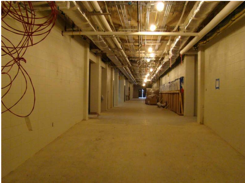
Corridor at Area 'G'