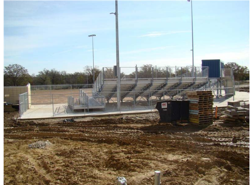
Grandstand/ Press-Box at Softball Field