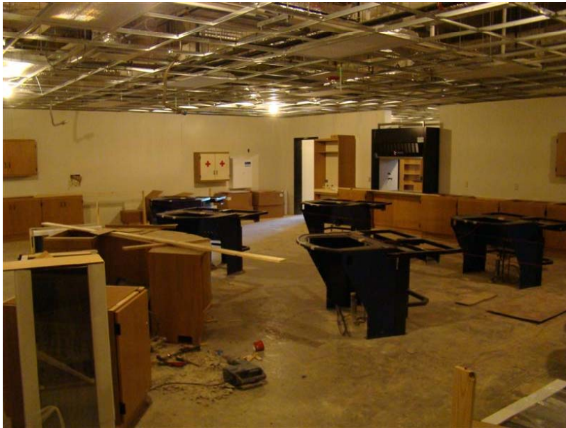
Science Desk Installation