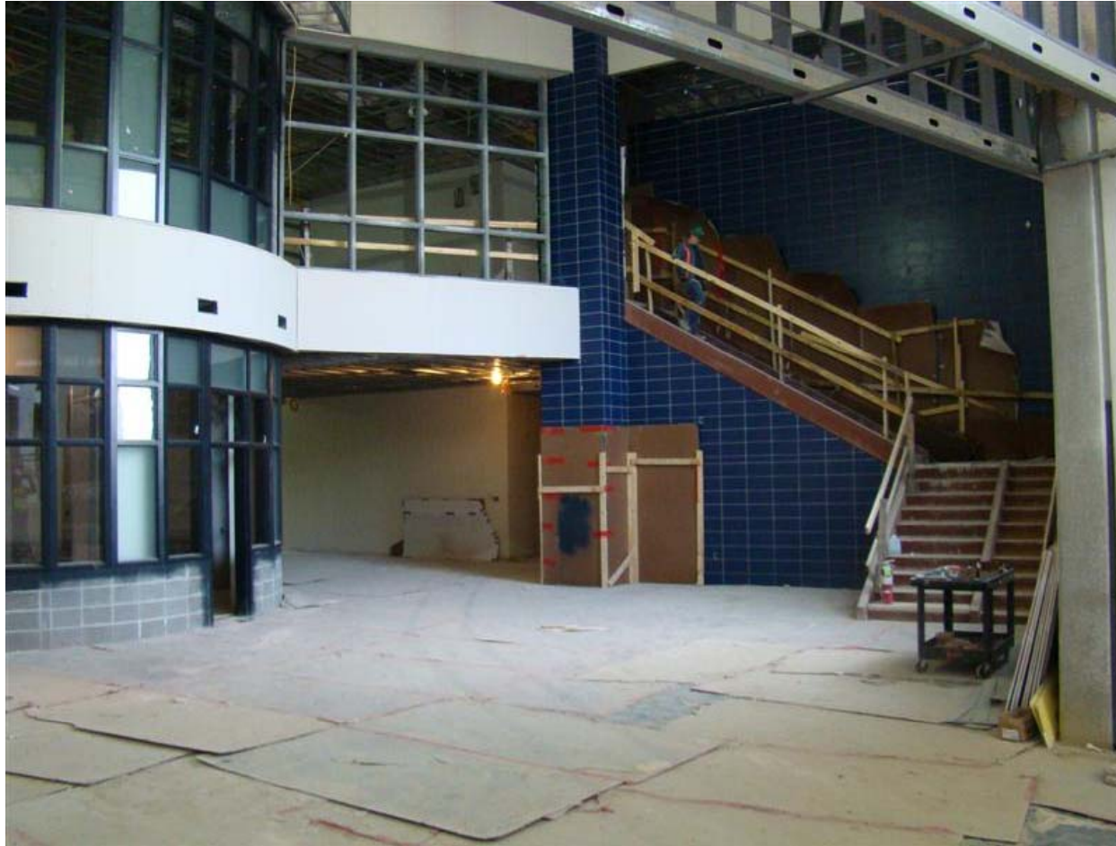
Eagles Nest and Staircase - View from "Main Street"