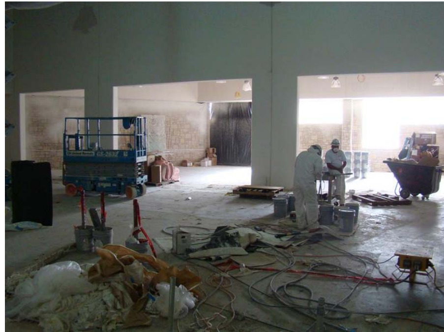
Interior View at Library