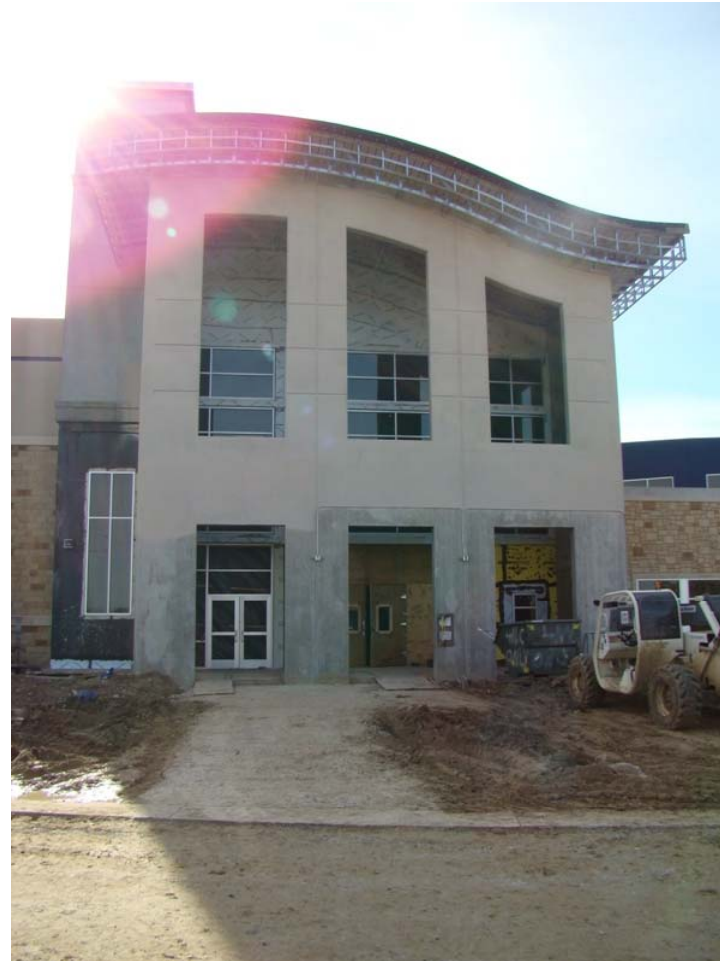
Exterior View of Main Entrance