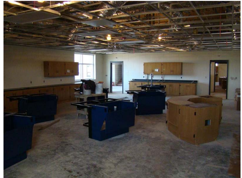
Science Casework Installation