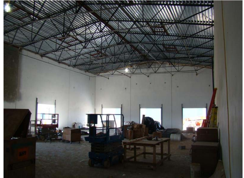
Continued Work at Building 'J' Interior