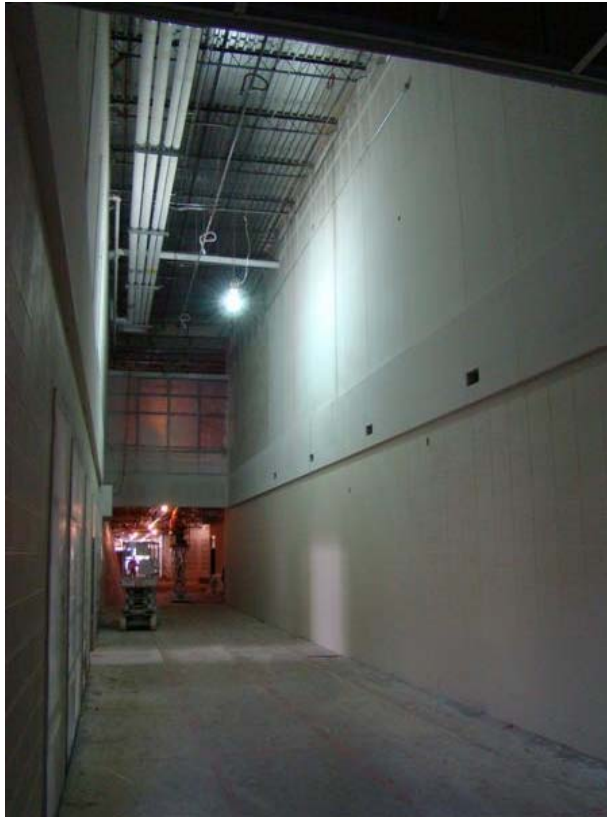
Corridor Adjacent to Library