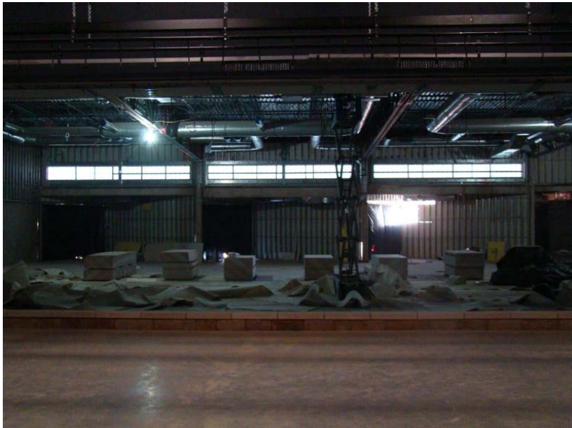
Stage View Toward Cafeteria