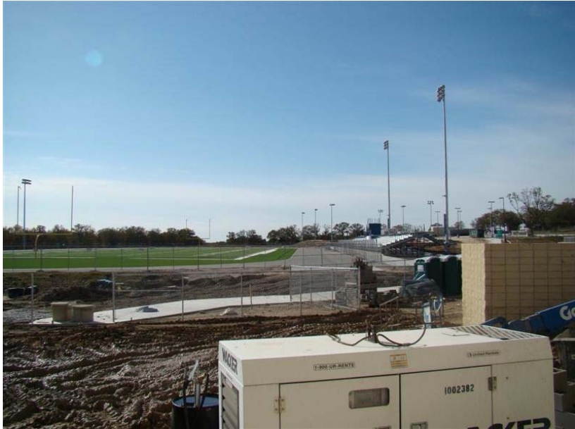
Grandstand Work at Football Field