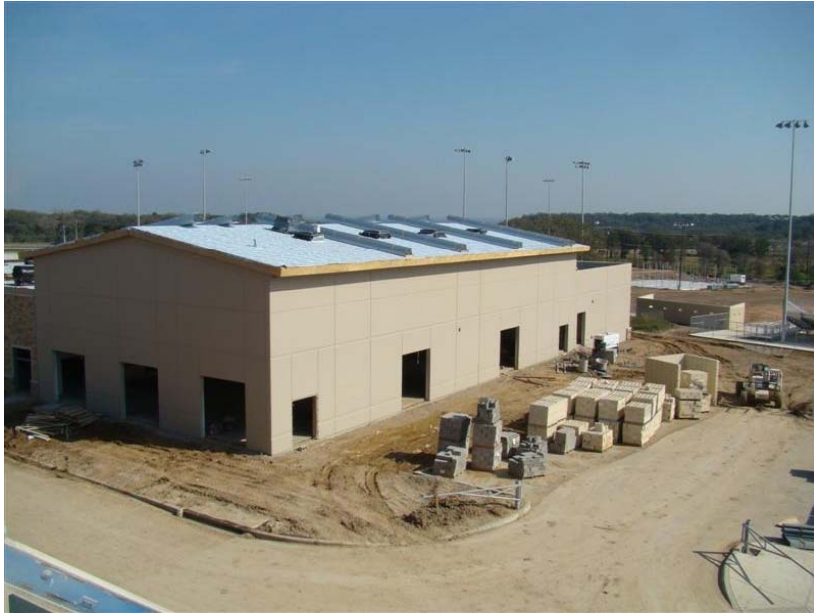
Continued Work at Building 'J' Exterior