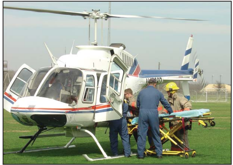
A student is taken by air from the car wreck.