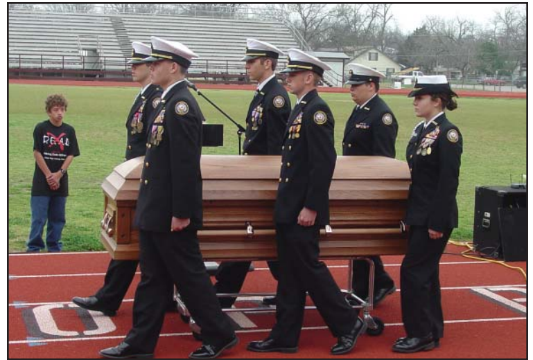
A mock funeral was held for the 2 students that died.