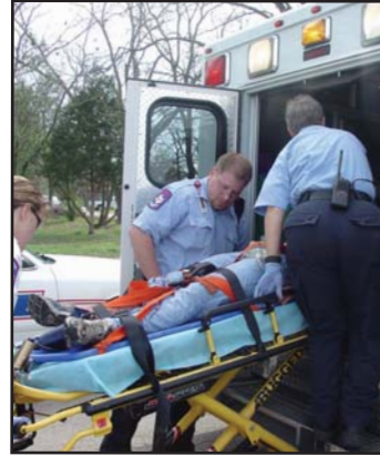
A BHS Student is loaded into an ambulance during the Shattered Dreams program.

Students at Bastrop High School were hit with the hard faced reality of losing two fellow classmates as part of the Shattered Dreams program. The program involved a simulated drunk driving incident complete with EMS, air ambulance services, the Justice of the Peace, law enforcement agencies and firefighters partaking like it was a real life situation.